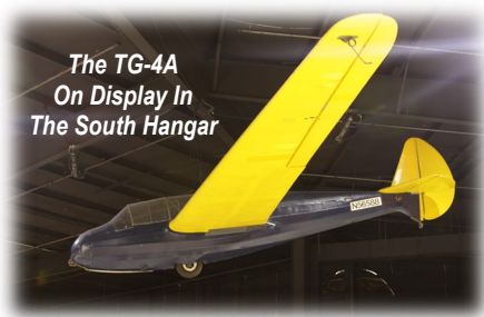
The TG-4A On Display In The South Hangar

The Southern Museum of Flight is fortunate to have TG-4A, Serial No.71 in our collection. This glider was originally transferred to the RFC ( Reconstruction Finance Corporation ) at South Plains Field, Lubbock, TX by the Army on February 1, 1945 and eventually came to the SMF on March 2, 1999.