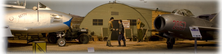
The Korean War's Iconic Jet Fighters On Display At The Museum's Kimpo Air Base Diorama

This "forgotten war" came on the heels of World War II and was overshadowed by the Vietnam War. It was feared that this tiny peninsula would be the setting for the eruption of World War III. When the United Nations joined forces with the United States and the Republic of South Korea to stop the invasion, this fear was justified. North Korea not only had the support of the Soviet Union government at that time, but also the military support of China. The stage was set for a bloody three years.