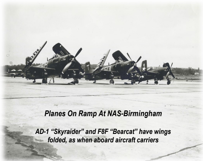
Planes On Ramp At NAS-Birmingham

AD-1 "Skyraider" and F8F "Bearcat" have wings folded, as when aboard aircraft carriers