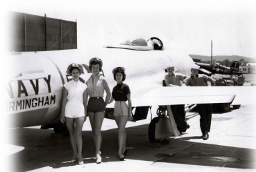
On the Flight Line: F4U "Corsair" and T2V "SeaStar"

Commissioned on September 15, 1948, NAS-Birmingham was established with Naval District 6 and served as a secondary reserve training base for NAS-Atlanta.